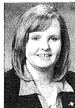
Gwen O'Mahony, MLA (Chilliwack-Hope)

Province of British Columbia Legislative Assembly