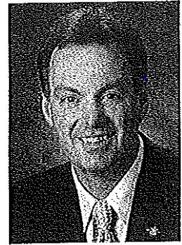
NORM MACDONALD, MLA (COLUMBIA RIVER-REVELSTOKE)

PROVINCE OF BRITISH COLUMBIA LEGISLATIVE ASSEMBLY