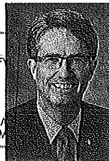
Laurie Throness, MLA Chilliwack-Hope Parliamentary Secretary to the Minister of Justice and Attorney General for Corrections

Constituency Office: 10-7300 Vedder Road Chilliwack BC V2R 4G6 Phone: 604-858-5299 Fax: 604-858-5290