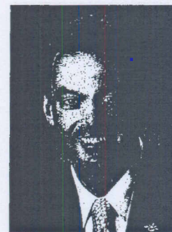
NORM MACDONALD, MLA (COLUMBIA RIVER-REVELSTOKE)

PROVINCE OF BRITISH COLUMBIA LEGISLATIVE ASSEMBLY