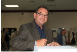
Osoyoos Mayor Stu Wells