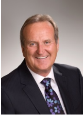
Penticton Mayor Garry Litke