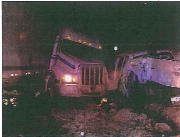
sb at right shoulder location