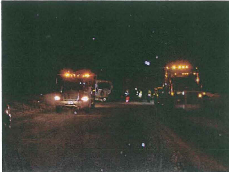
Straightening 1 st vehicle, container trailer

2053 the 2 nd ambulance heads n/b in the s/b lanes. To give you a picture, there's a couple a km worth of trucks mainly and some cars and light vehicles, stacked up leaving a lane partially open so emergency vehicles can get through. These ambulances will be going back to where Hardy is then he'd be escorting them back to Juliet I suppose using the same cross over.