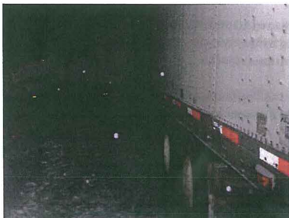
Sb at left (median) location