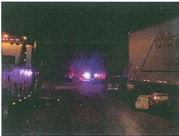
Sb at accident scene