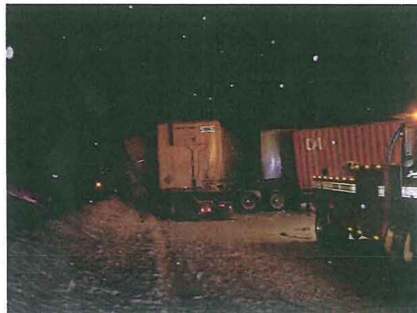
looking north, pickup at left Beside pickup is tractor of 2 nd vehicle container trailer is 1 st vehicle back right is trailer of 3 rd vehicle