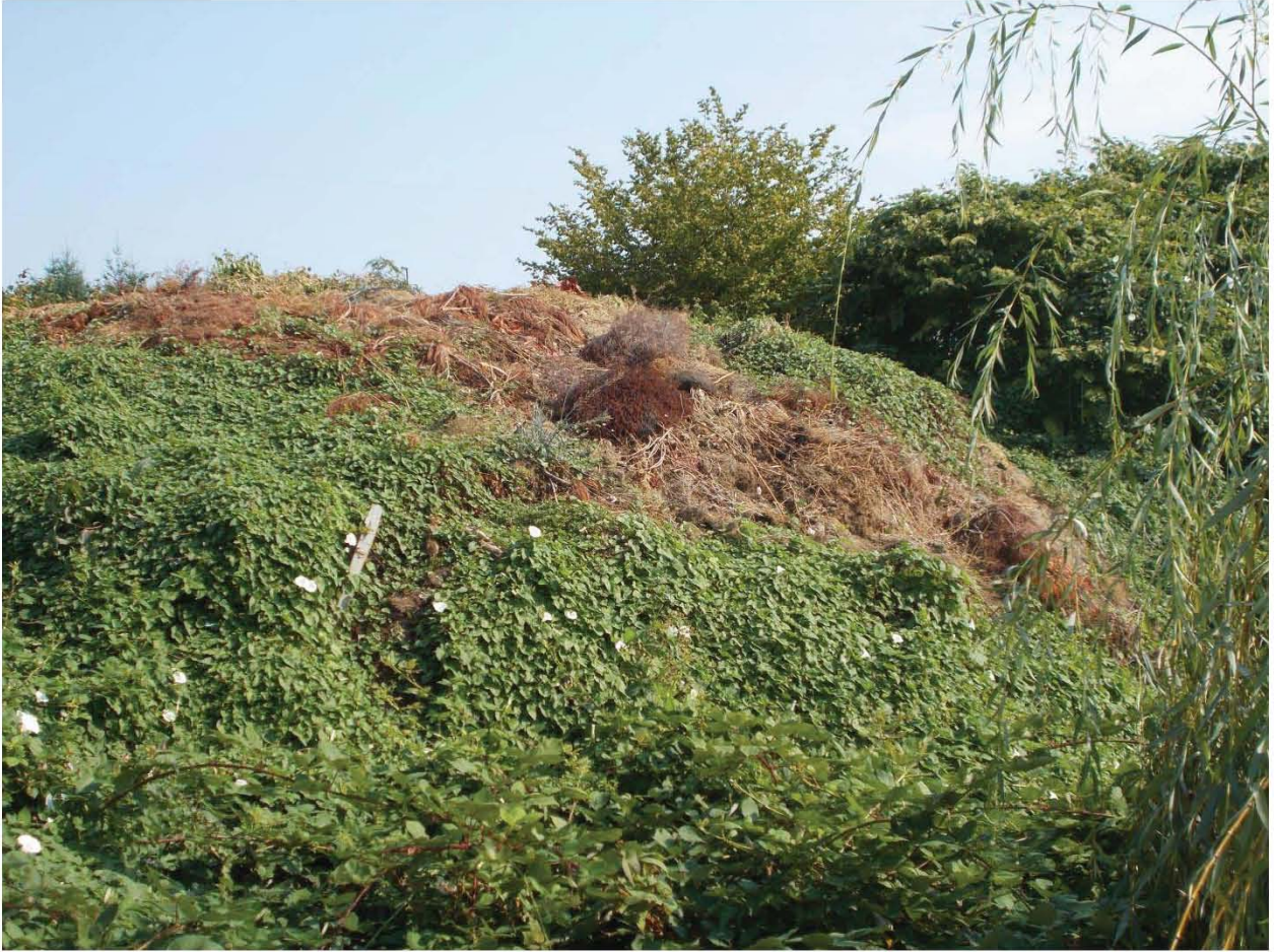
Southern site bank.