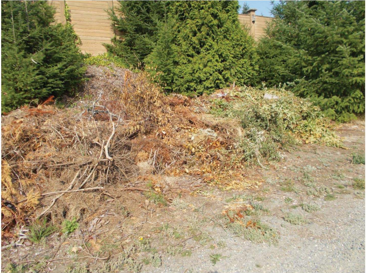
Northern site , parkway sound barrier adjacent.

This is the appearance of the dump sites as of August 23, 2014: