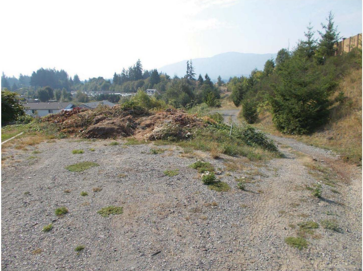
Southern site top of bank.