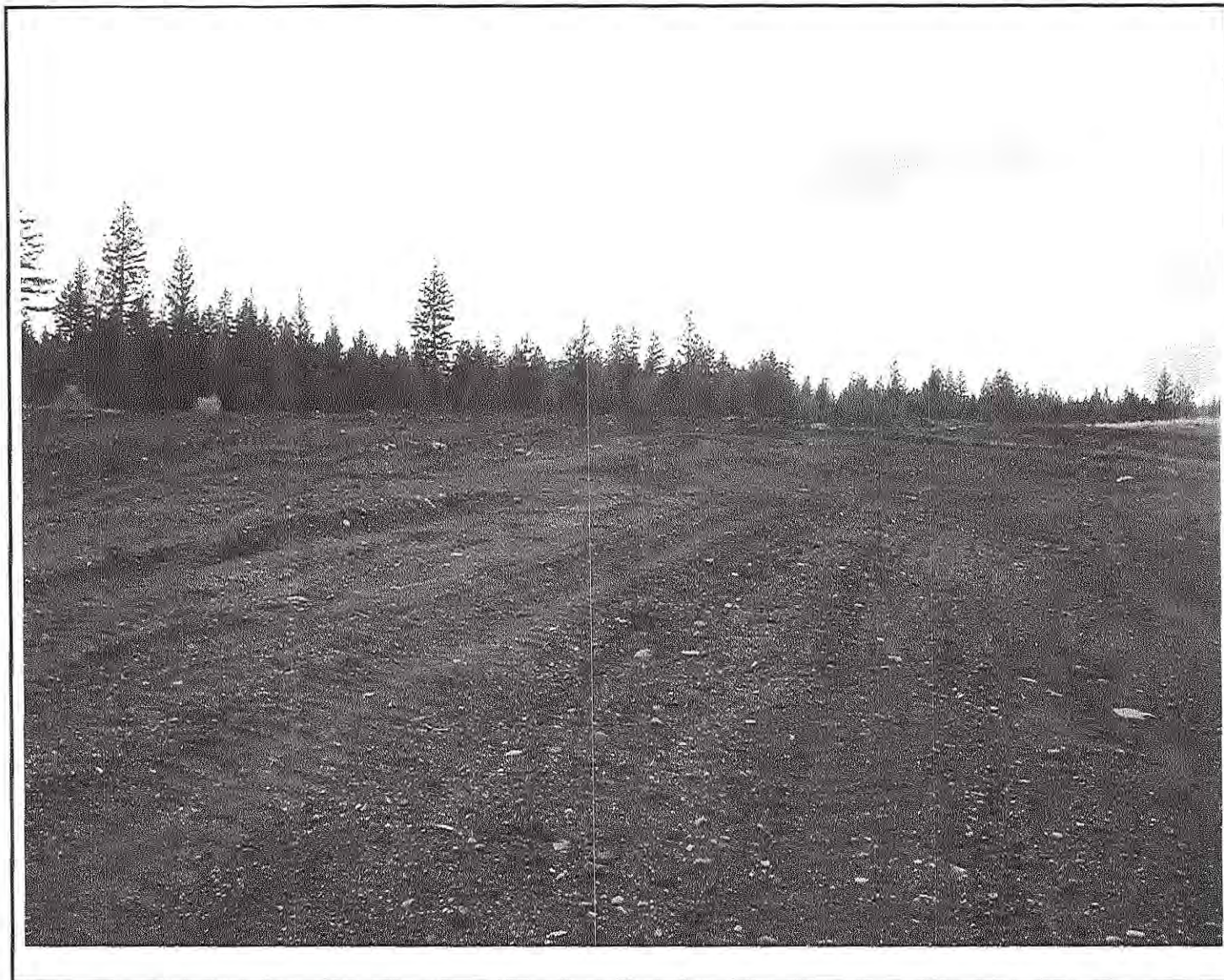
Southern section of quarry ready for seeding