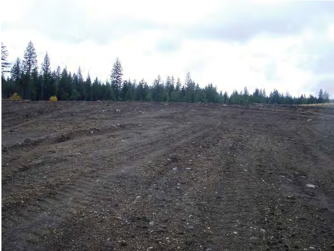
Southern section of quarry ready for seeding