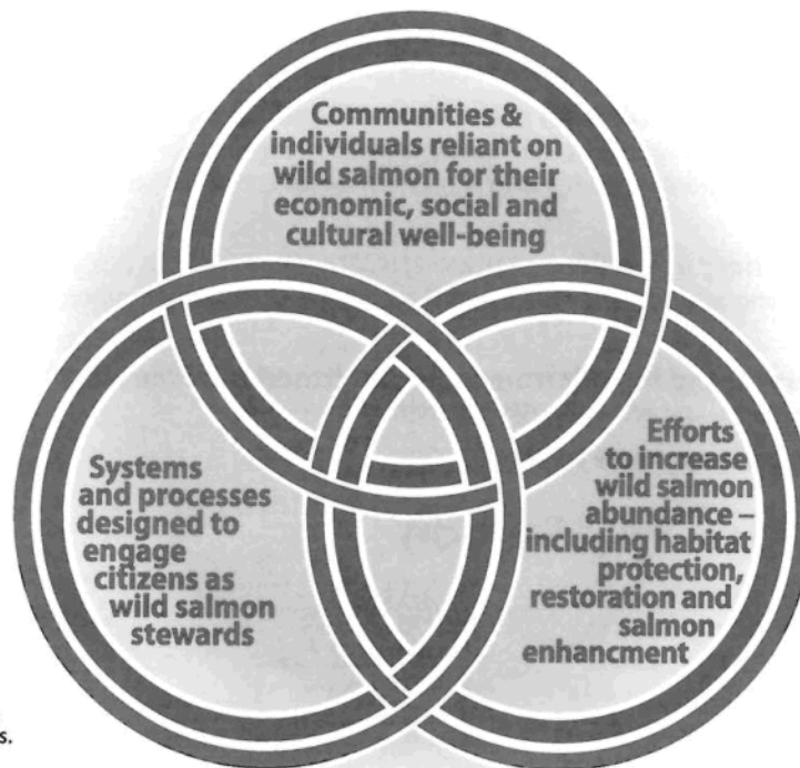
Figure 2. Virtual circle of inter-connectedness.

As illustrated above in Figure 2, WSAC members heartily agree that wild salmon abundance, stewardship and sustainable harvesting practices are connected in a virtuous circle. One without the other two is far less likely to succeed or matter in the longer term. Wild salmon abundance is dependent on people who care about salmon and are prepared to play a role in their survival. Community stewardship engages people to learn and care about wild salmon and creates mechanisms for individuals and communities to participate in resource renewal and sustainable resource management. Communities and resource users – such as commercial and recreational fishers who are contributing jobs and economic opportunity to their communities, understand and have a stake in being resource stewards. Indigenous communities dependent on healthy and abundant stocks for food, social and ceremonial purposes, as well as for economic health, have a constitutionally protected right to participate in fisheries stewardship and management. All parts of this system support and reinforce each other.