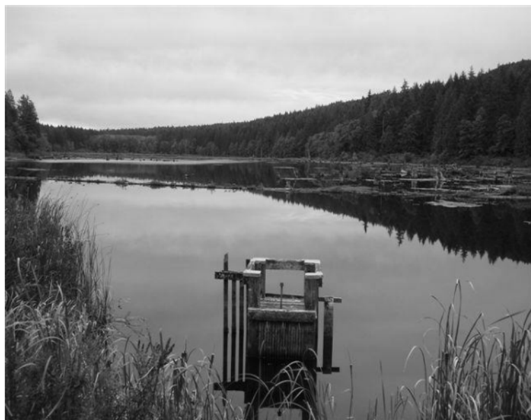
Figure 1: Langley Lake

Langley Lake is primarily a spring-fed lake. It also has several creeks that feed it during the winter rains from the Island Timberlands property that forms the watershed area. The dam at Langley Lake was refurbished in the late 1970's. A new deep intake to the Lake was installed in 1999. The Lake has a licensed storage capacity of 160 acre-feet or 197,357 m 3 but has a reported volume of 690,000 m 3 . Water flows over the spillway for approximately seven months of the year (October to April). This spilled water follows Washer (Hart) Creek to the ocean.