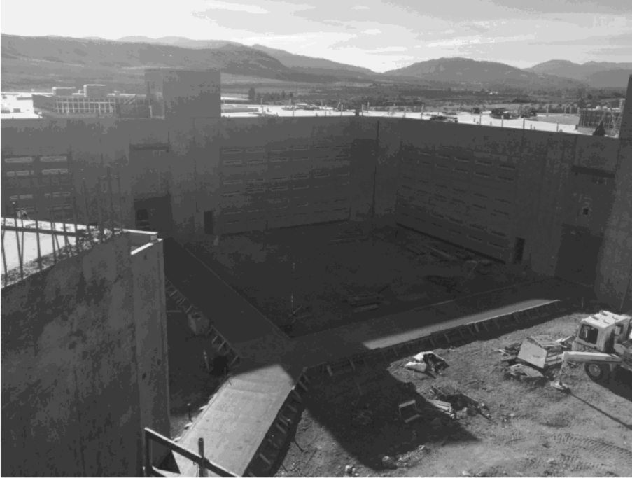
Below: Vertical polycarbonate panels installed and rough grading underway in greenhouse