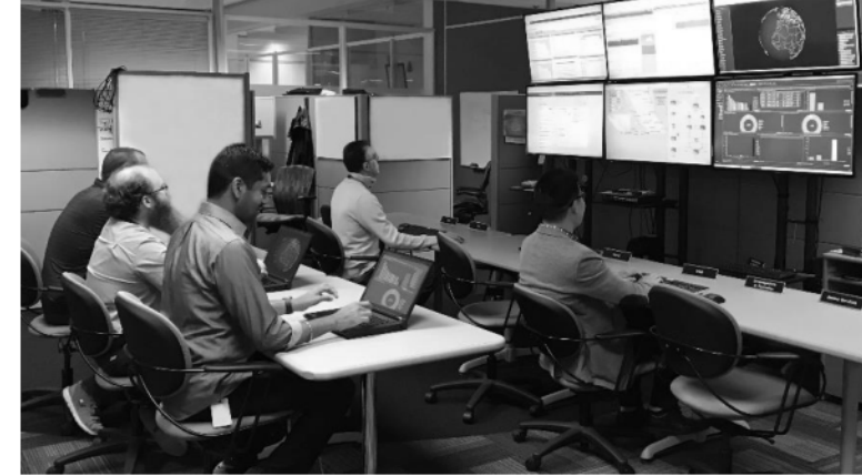
Security Operations Centre for BC Government