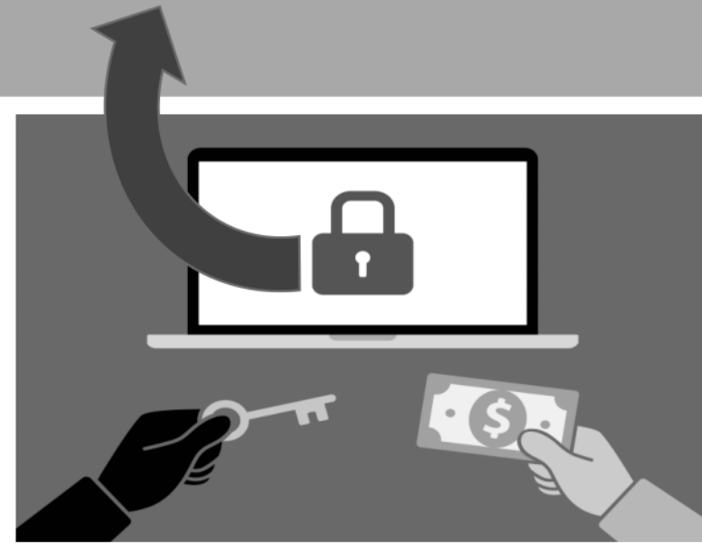
LifeLabs says it paid ransom to secure millions of customers' stolen medical data