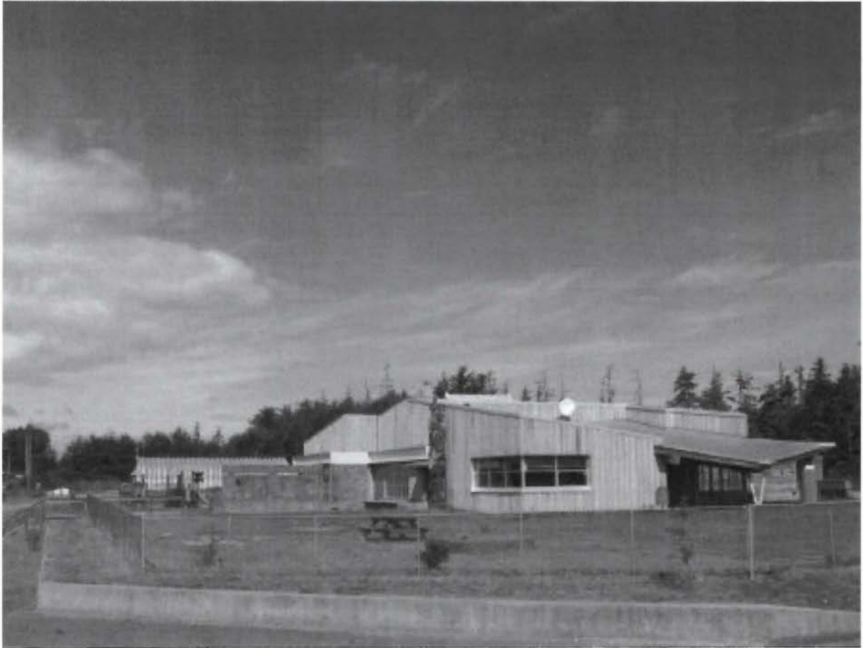
Chief Matthews School