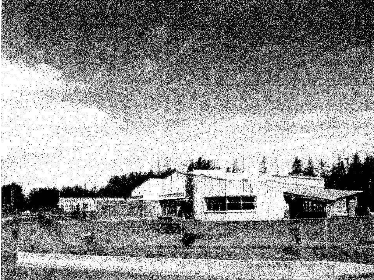
Chief Matthews School