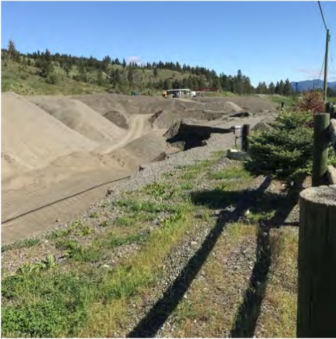
Eastern pit wall, looking north.