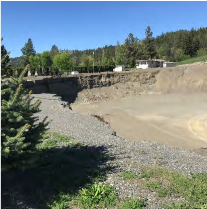
Eastern pit wall, looking south.