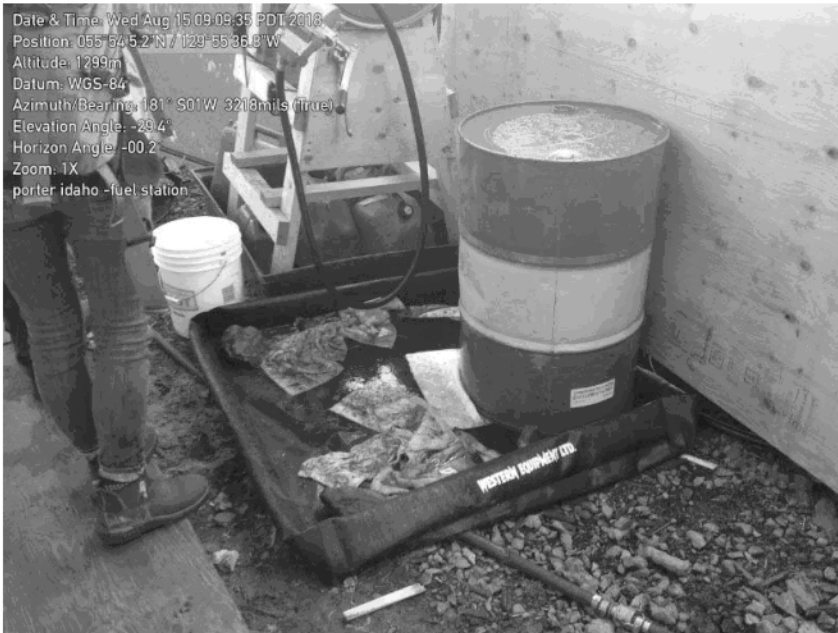
Photo is of the secondary containment at the fueling station.