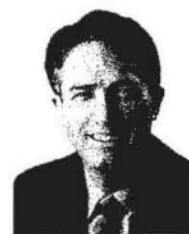
Laurie Throness, M.L.A. Chilliwack-Hope

Province of British Columbia Legislative Assembly