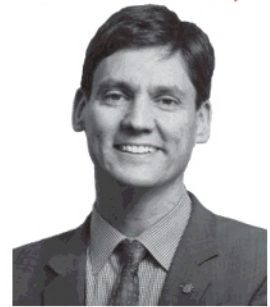
David Eby, MLA (Vancouver-Point Grey)