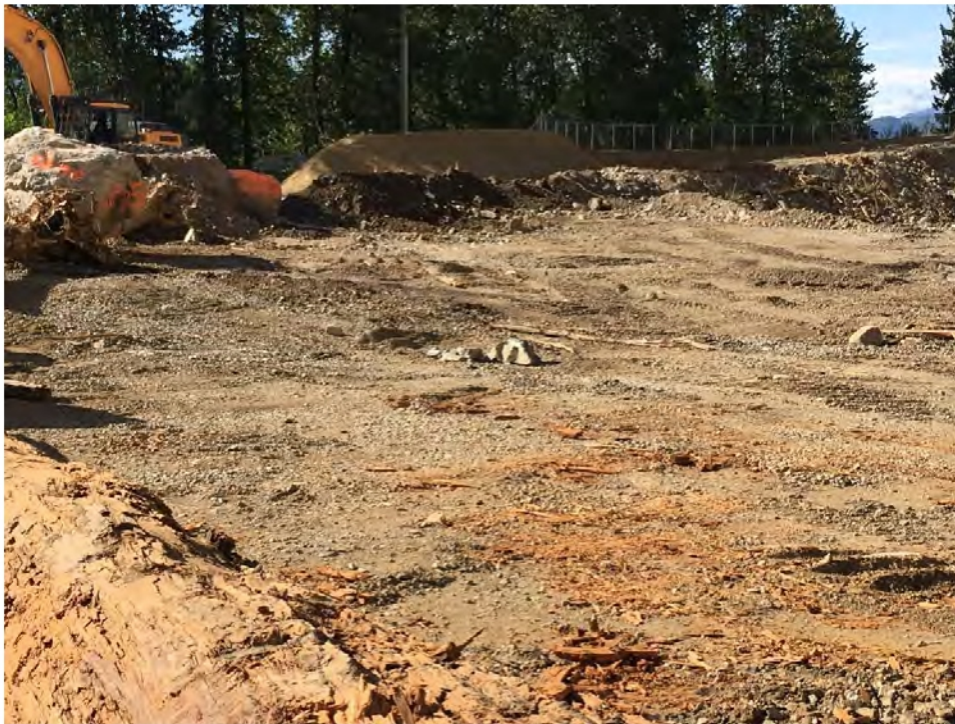
Photo 12. View of the marked buffer looking south from the buffer north of the truck entrance.

No quarry/construction activities will take place within the 50-meter non-disturbance buffer. Nor will any equipment enter the established buffer.