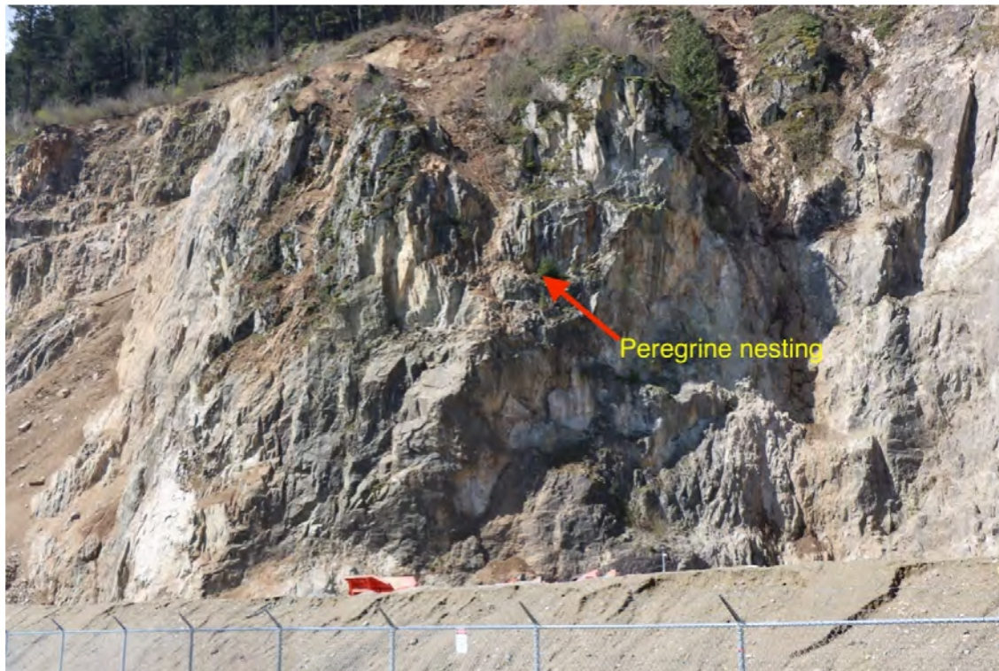
Figure 1. The location of the Peregrine nest at the Quadling Quarry May 10, 2021.

Peregrine activity was noted while establishing the no-disturbance buffer. The female was observed eating prey at 0710 and the male flew to the nest for a turn at incubating. Quarry activities were ongoing after 0700.