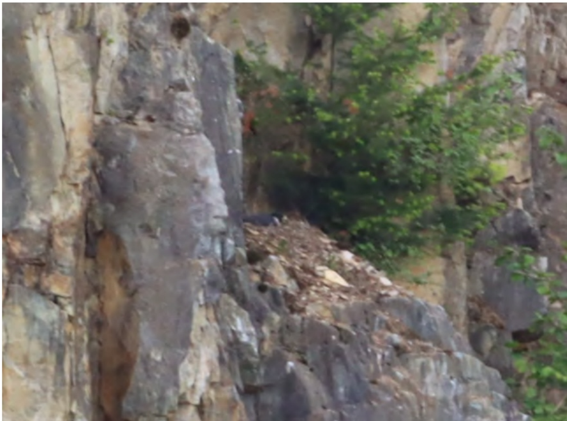
Figure 1. Female Peregrine Falcon on the nest photographed 1:54 PM by Thomas Plath, May 10, 2021.

The behavior of the pair is consistent with a mated, courting pair on territory. The female and male was observed on the nest ledge from the evening of May 7 th through to the afternoon of May 9 th by observers familiar with the pair and were photographed. Behaviors on the nest ledge by the female on May 10 th appeared to be that of one in the process of egg-laying (see Figure 2).