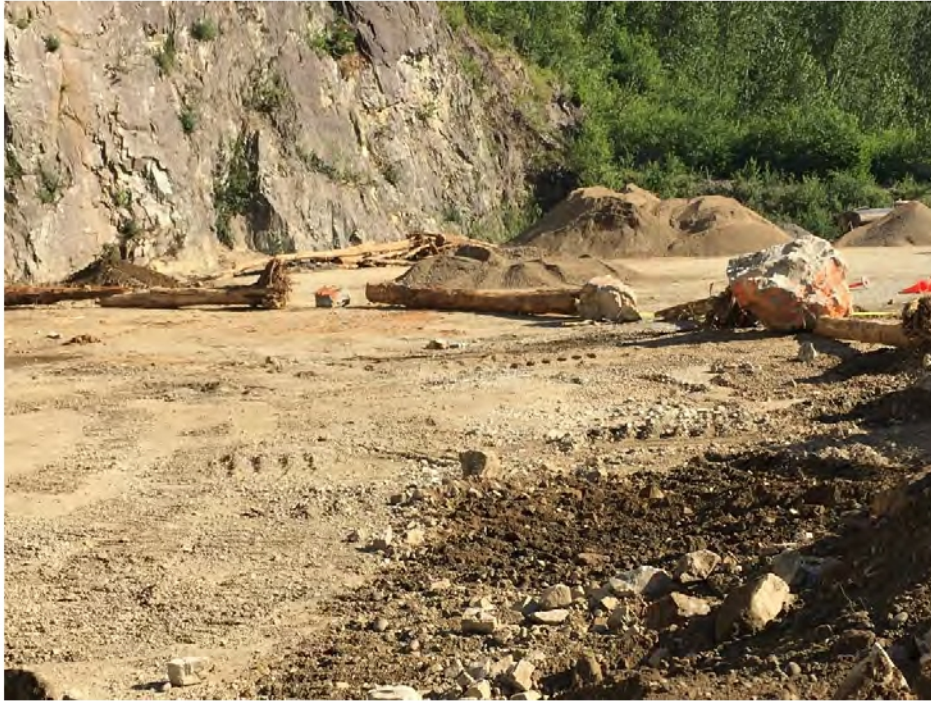
Photo 1. A view of the marked buffer, looking north from the pit floor.

No quarry/construction activities will take place within the 50-meter non-disturbance buffer. Nor will any equipment enter the established buffer.