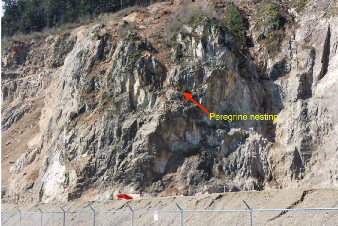
Figure 1. The location of the Peregrine nest at the Quadling Quarry May 26 th , 2021.