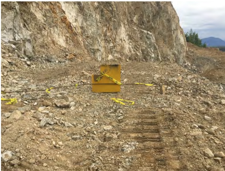
Photo 2. View of the buffered access road 130 meters southwest from the nest.

An attempt was made to delineate the buffer at the top of the cliff. The terrain was too dangerous to get within 50 meters. The access road top to the top of the cliff and behind the nest is between 130 to 190 meters from the nest measured with a GPS (4 meters accuracy). Quarry activities at the top of the cliff face are limited to the area approximately 100 meters or greater northeast of the nest (estimated). The access spur road located on the upper cliff 130 meters southwest of the nest was buffered (see Photo 2).