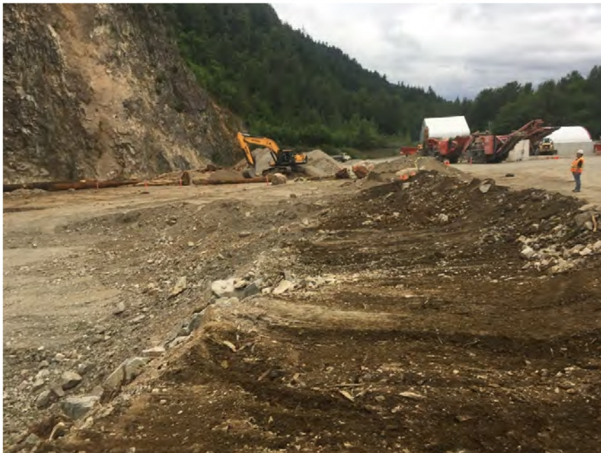
Photo 1. A view of the marked buffer, looking north from the pit floor

Thomas Plath Environmental Services was retained by Mountainside Quarries Ltd to implement Peregrine Falcon mitigation at 40251 Quadling Road, Abbotsford. Protection measures for the Peregrine Falcon at the fore-mentioned property satisfy the signed Mitigation Agreement between FLNR and Mountainside Ltd as part of the General Permit Conditions.