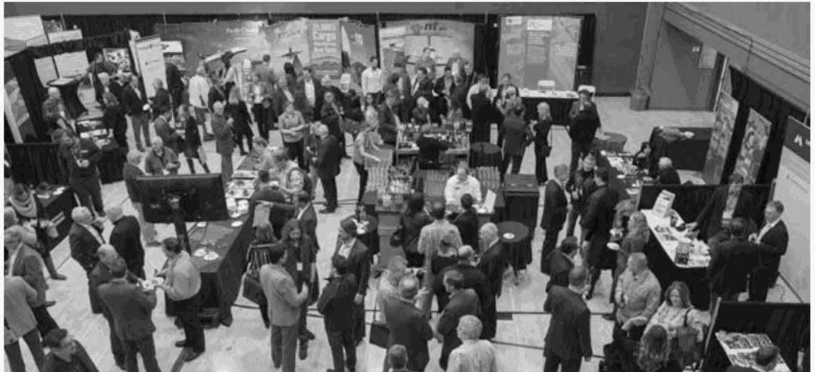
Incredible energy and participation at the BC Natural Resources Forum Tradeshow