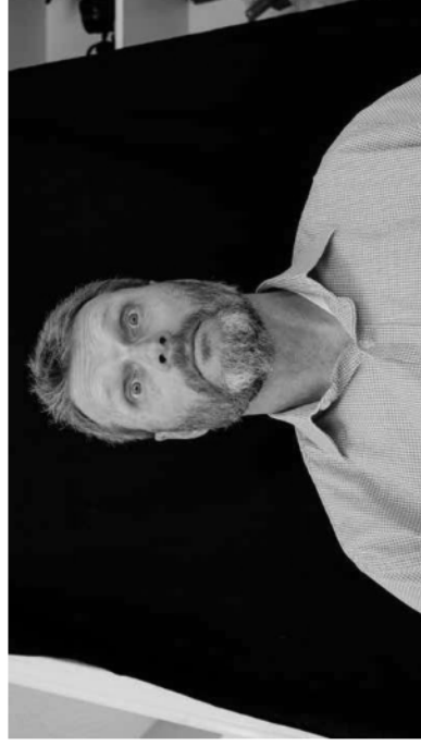
The difference perspective makes: the image on the left was captured with the camera at eye level and perpendicular to the floor, while the image on the right was captured with the camera angled up, which distorts the subject and the background.