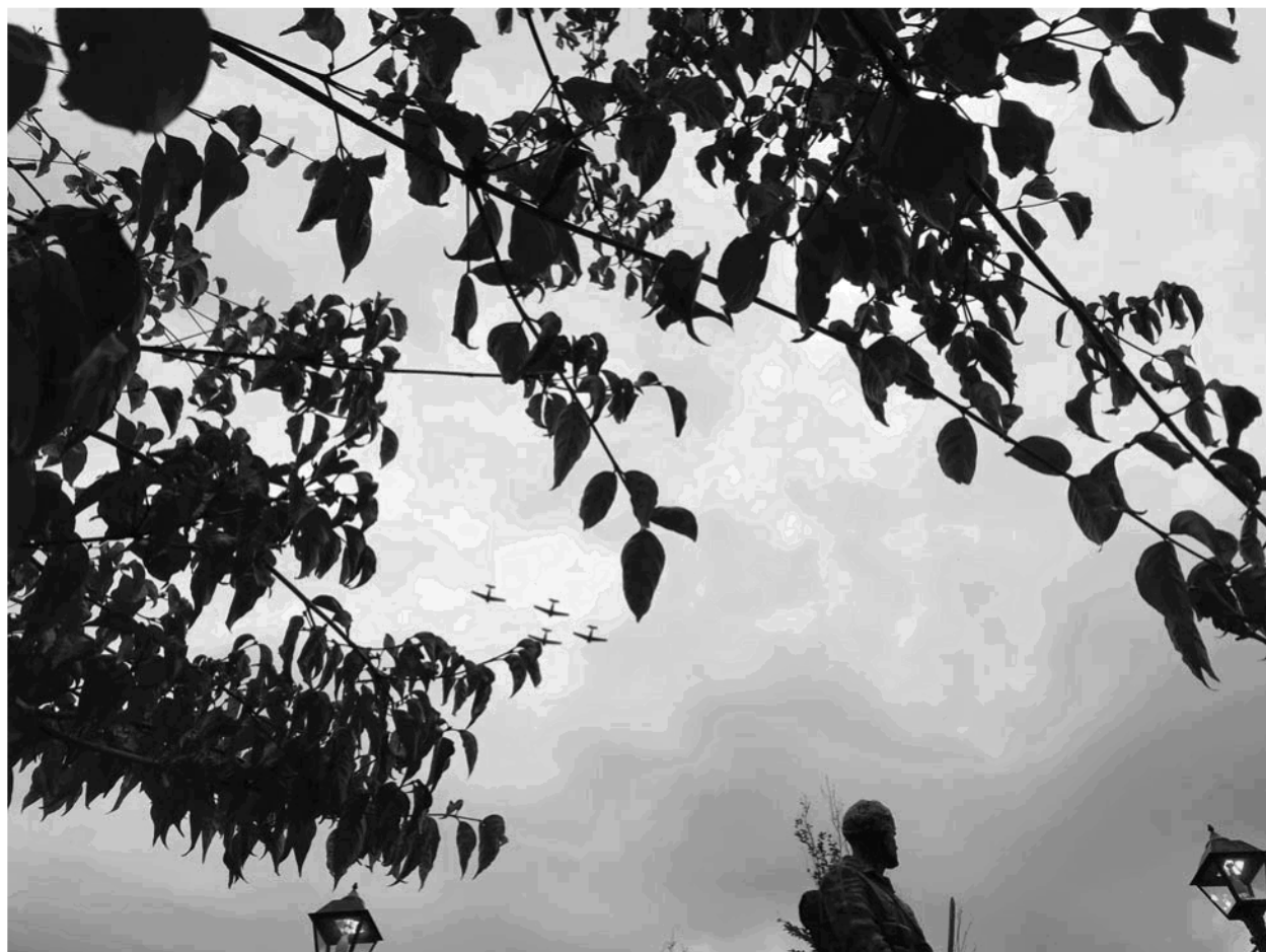
Revised 1/2018 Caption: A low-angle view of a cloudy sky, with the silhouettes of tree branches and a statue in the foreground. Several small, dark, cross-shaped objects are visible in the sky.