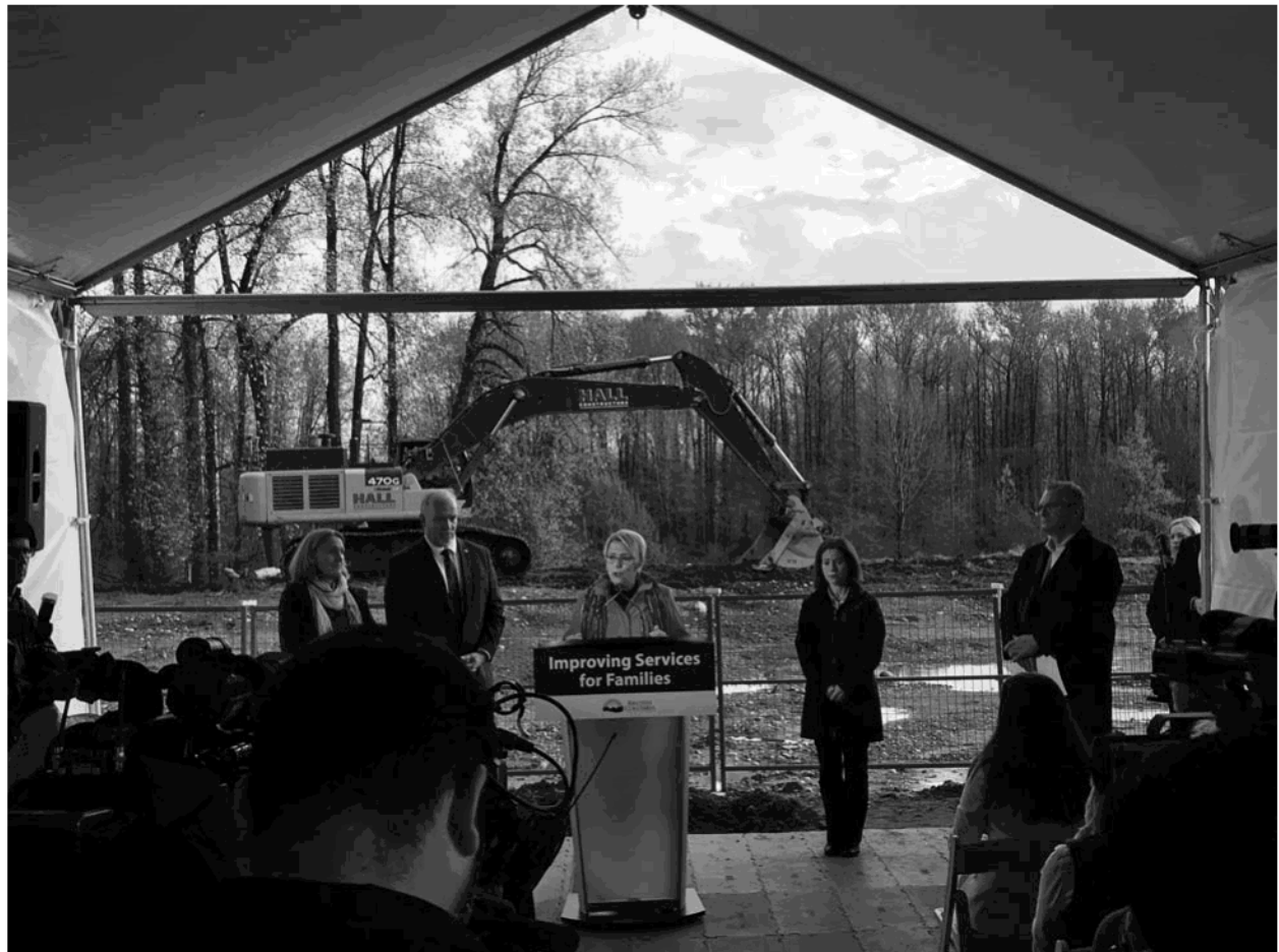
Photo 1000 Excavator and people at the site during the opening of the new facility