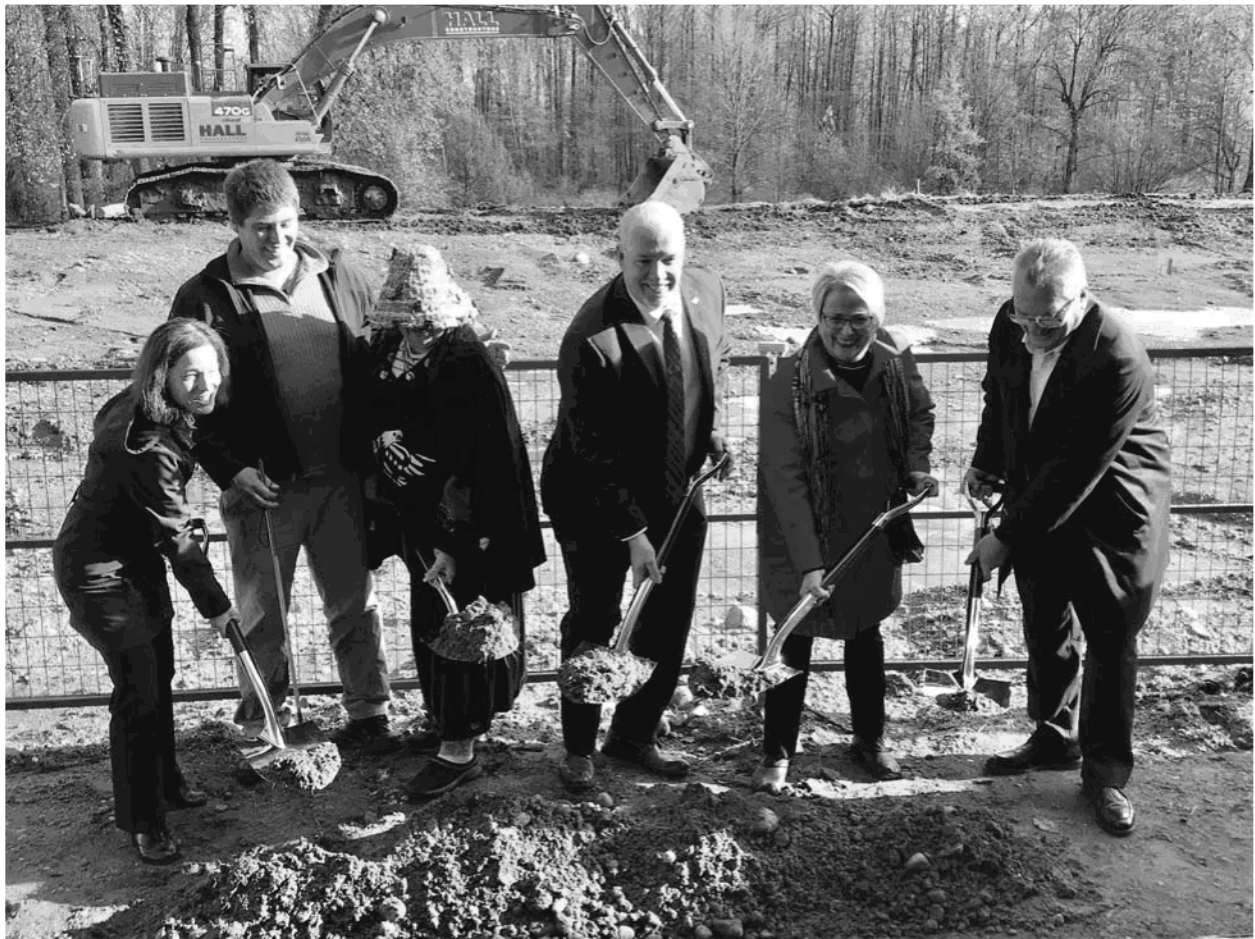
Raymond L. O'Neil Premier of Ontario Minister of Natural Resources and Forestry