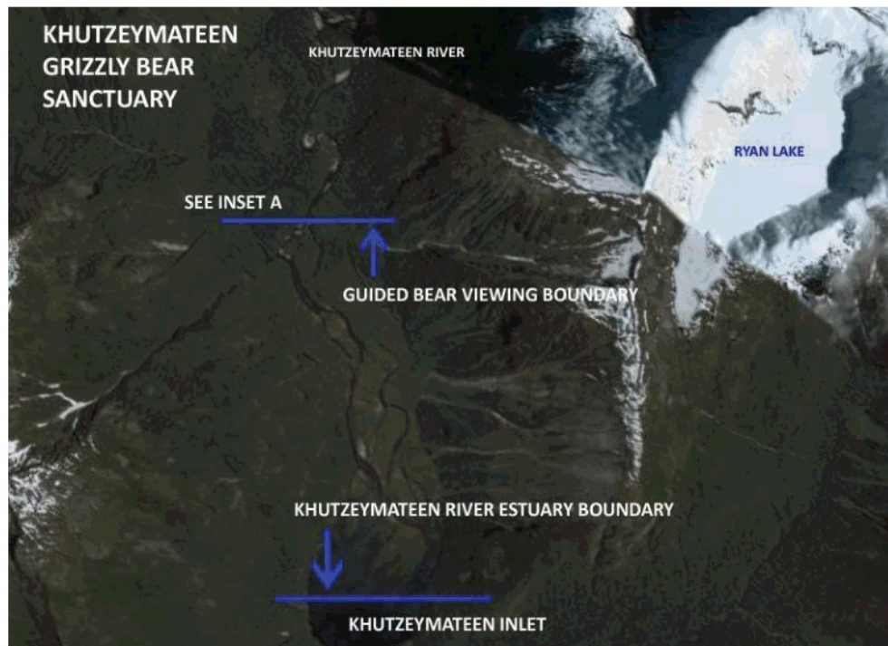
IMAGE OF KHUTZEYMATEEN GRIZZLY SANCTUARY RIVER ESTUARY GUIDED BEAR VIEWING BOUNDARY