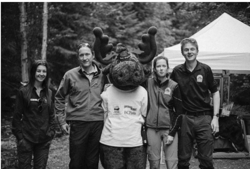
Jerry the Moose with some of the 2019 BC Parks Student Rangers in Spruce Lake!

The 2019 BC Parks Student Ranger Program hired 48 students between the ages of 18 and 30 to work in BC Parks and Protected Areas from May to the end of August. Student Rangers were assigned to a crew, with each crew consisting of 1 Crew Lead and 3 Crew Members. For the 2019 season, the program saw a total of twelve crews across the province located in Victoria, Black Creek, North Vancouver, Sechelt, Manning Park, Cranbrook, Kamloops, Williams Lake, Bella Coola, Prince George, Terrace and Fort St. John. Thirty percent of 2019 Student Rangers self-identify as Indigenous and the program continues to promote cultural learning opportunities and relationship building with First Nation communities. Over the 2019 season, crews performed project work in approximately 110 Provincial Parks and Protected Areas, completing over 220 projects in the program areas of Conservation, Recreation, Indigenous Relations and Public Outreach.