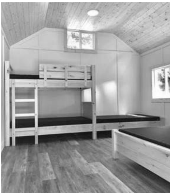
One of 25 new cabins at Cultus Lake