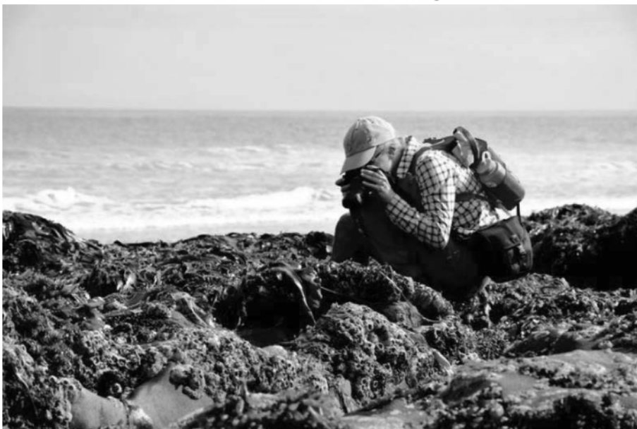
Naikoon Provincial Park in Haida Gwaii.

document biodiversity. Last spring, scientists at SFU and UVic set up an iNaturalist project for all of BC Parks. Since then, a team of students, BC Parks staff and the public have been busy populating it. Momentum for this project has grown with the support of the BC Parks Foundation , and we now have more than 100,000 observations and counting!