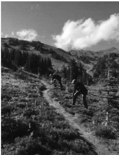
Manning Park – June 2019 Getting the work done – August 2019