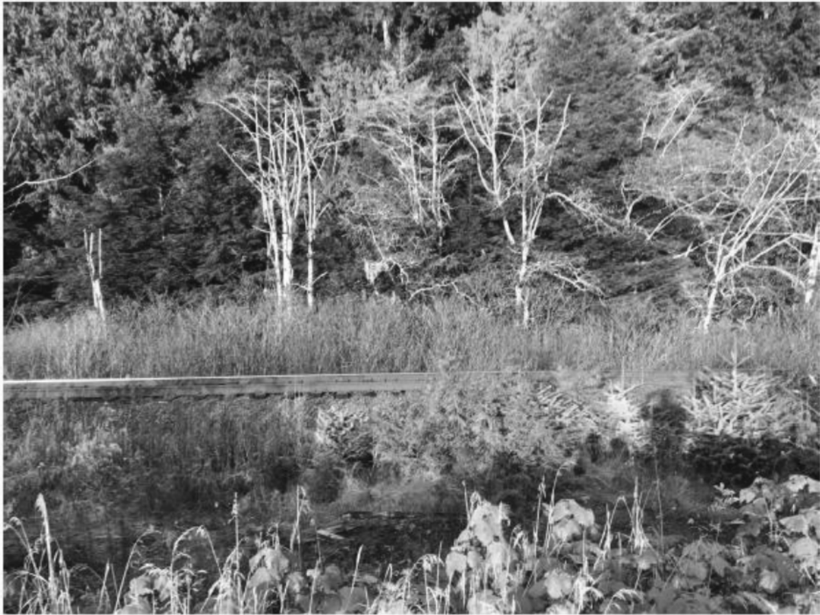
Img : Photo 1 - herbicide-damaged vegetation along CN Rail line (east of Basalt Creek, along Hwy 16).JPG