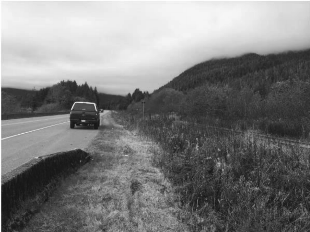
Img : Photo 3 - herbicide-damaged vegetation along CN Rail line (West of Kyex River, along Hwy 16).JPG