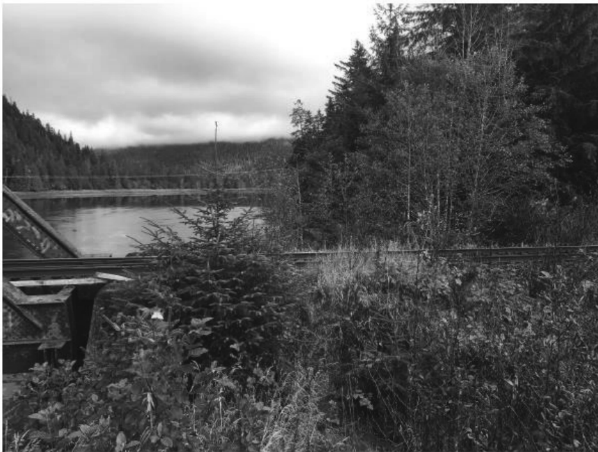
Img : Photo 5 - herbicide-damaged vegetation on CN Rail line (east of Kyex river, along Hwy 16).JPG