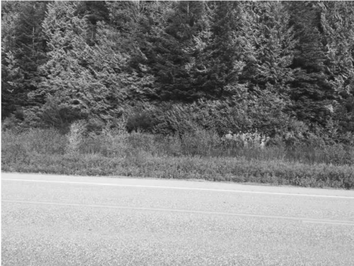
Img : Photo 4 - herbicide damage to conifers along CN Rail line (east of Basalt Creek, along Hwy 16).JPG