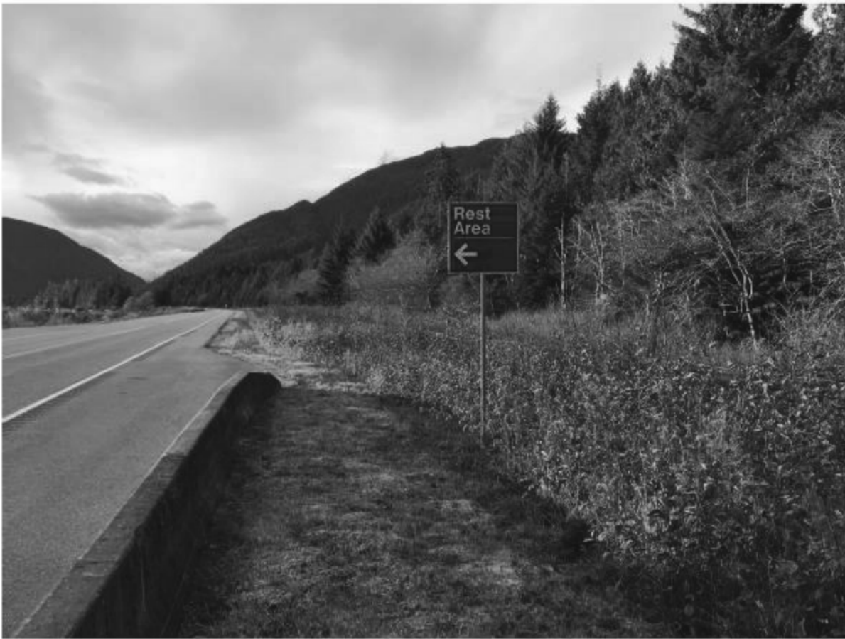
Img : Photo 2 - herbicide-damaged vegetation along CN Rail line (30 m West of Basalt Creek, along Hwy 16).JPG