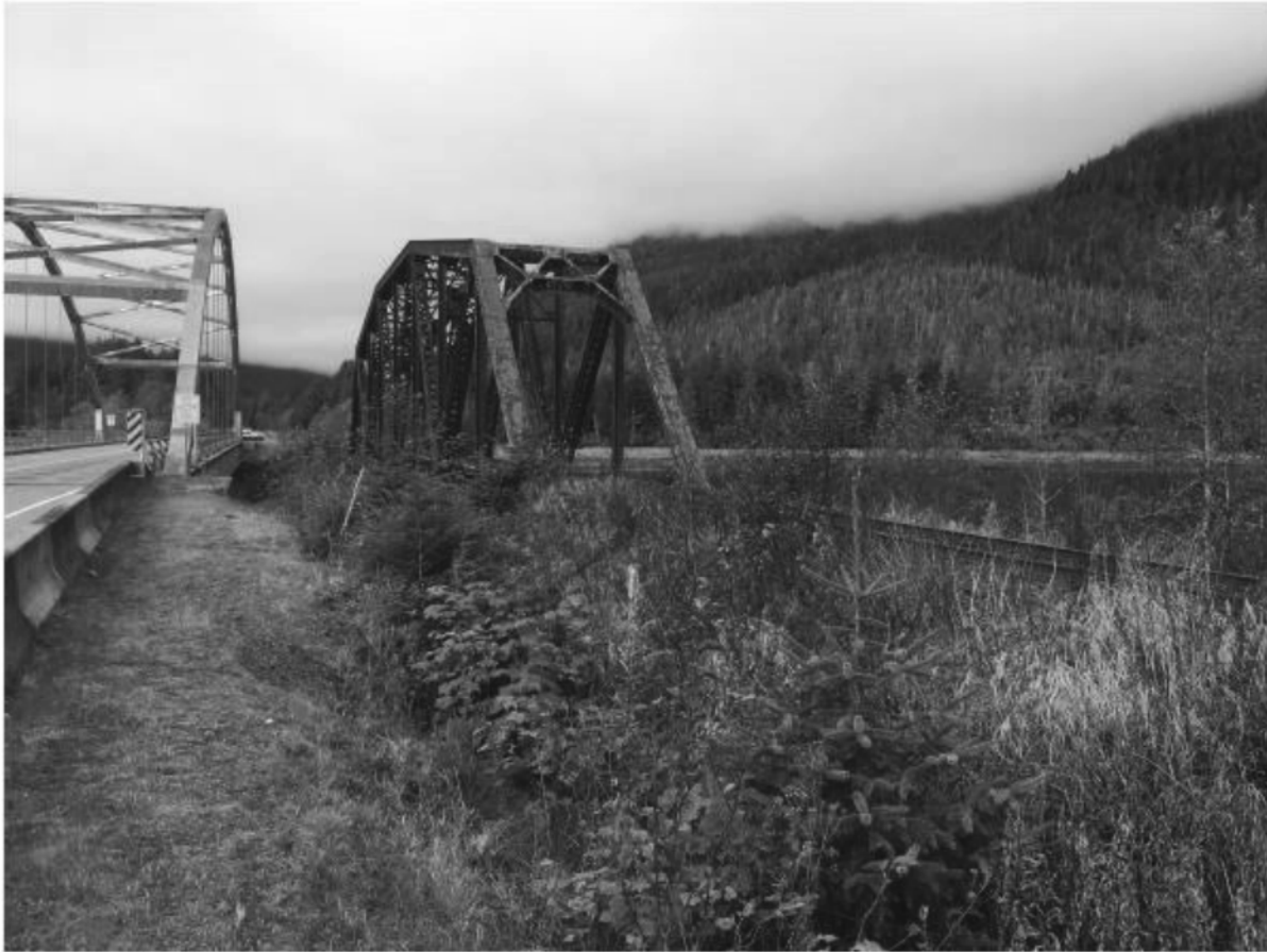
Img : Photo 6 - herbicide-damaged vegetation on CN Rail line (east side of Kyex river, along Hwy 16).JPG