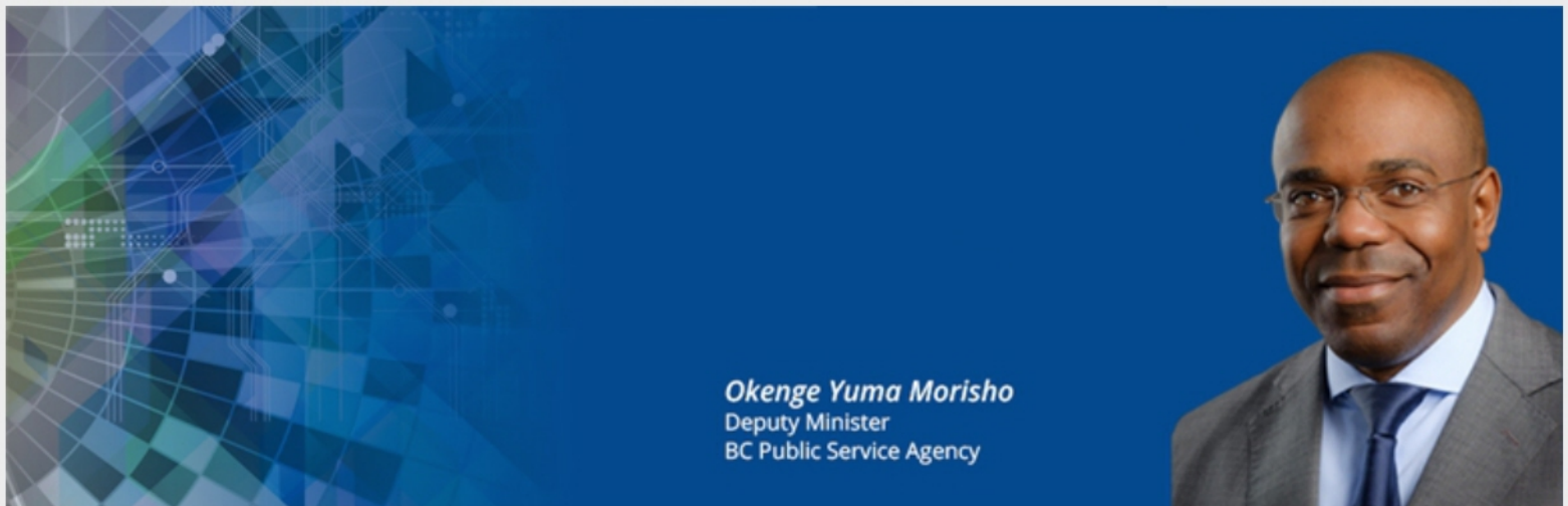
Okenge Yuma Morisho Deputy Minister BC Public Service Agency

• A SELECTION OF WHAT'S MAKING NEWS RIGHT NOW •