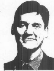
David Eby, MLA (Vancouver-Point Grey)

Province of British Columbia Legislative Assembly