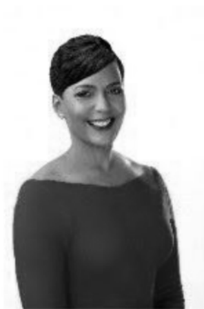
KEISHA LANCE BOTTOMS MAYOR