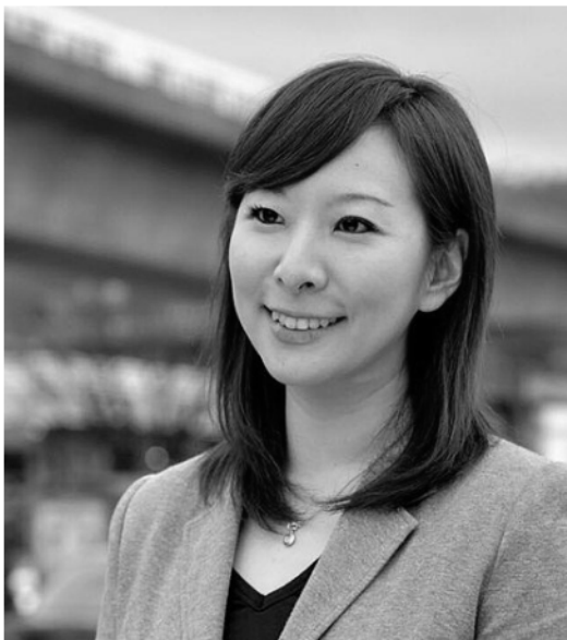
The Honourable Katrina Chen, British Columbia Minister of State for Child Care

Ron McKinnon, MP for Coquitlam-Port Coquitlam