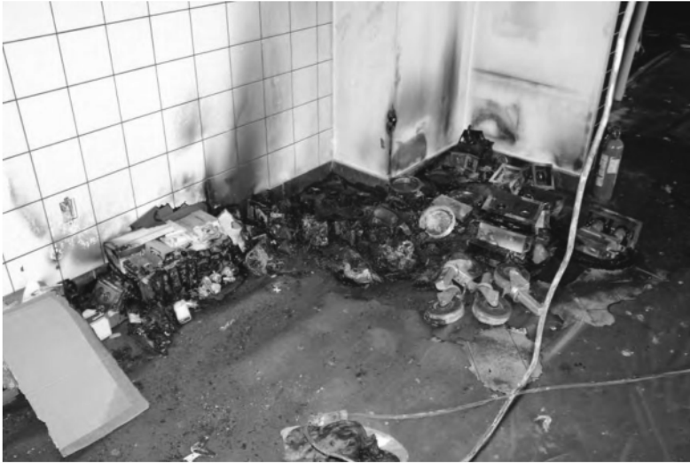
Figure 5 – Electrical building materials in seating area