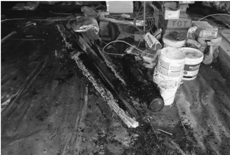
Figure 6 – Building materials in seating area