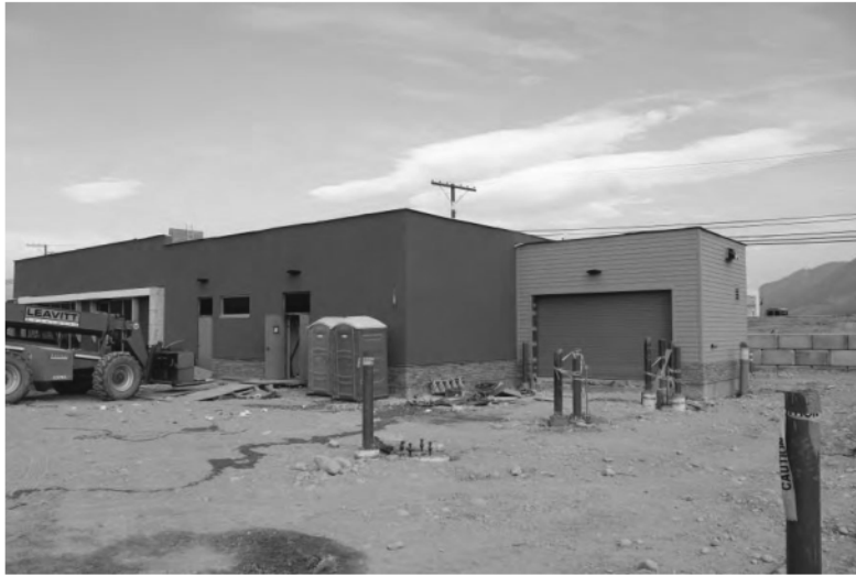
Figure 2 - Exterior Delta Side showing open man door