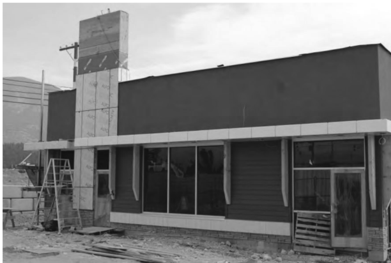
Figure 1 - Exterior Alpha Side