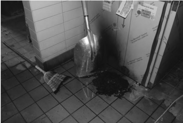
Figure 7 – Broom found in kitchen area