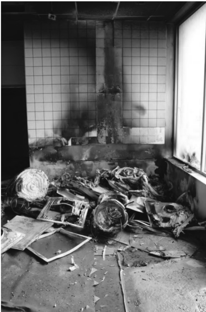
Figure 4 – Area of most fire damage