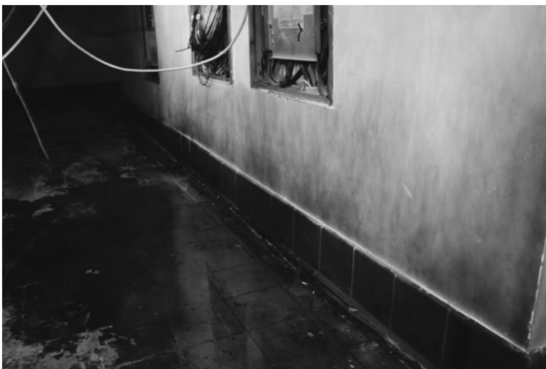
Figure 8 – Floor area burns, like other floor area burns throughout the building