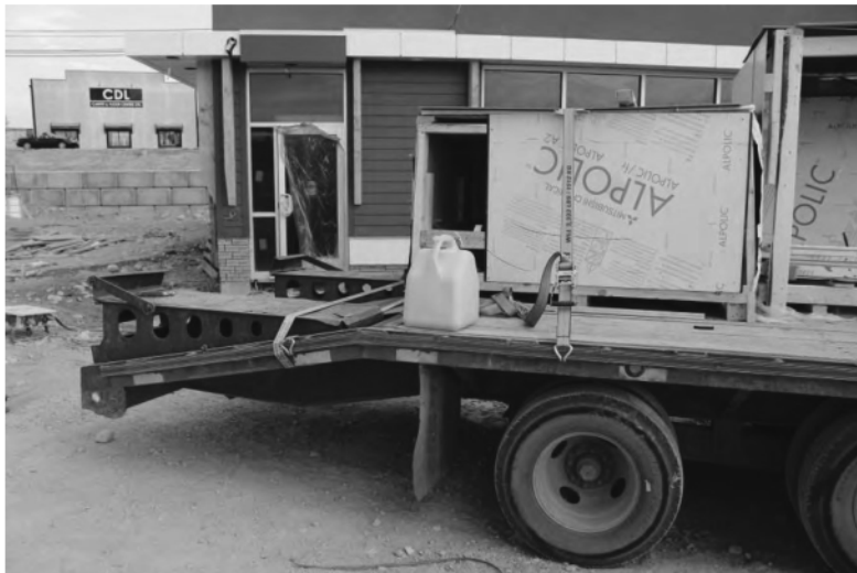
Figure 3- 20 litre Diesel located on Delta side