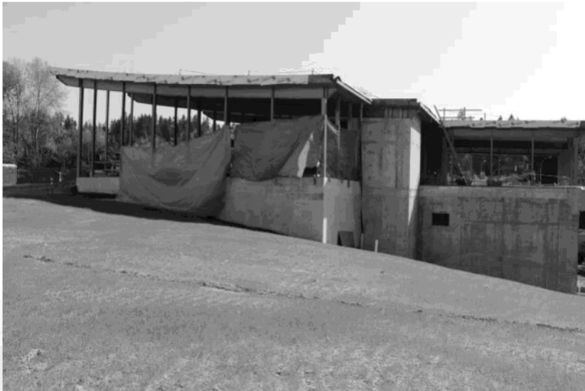
Inlet Centre Station west headhouse