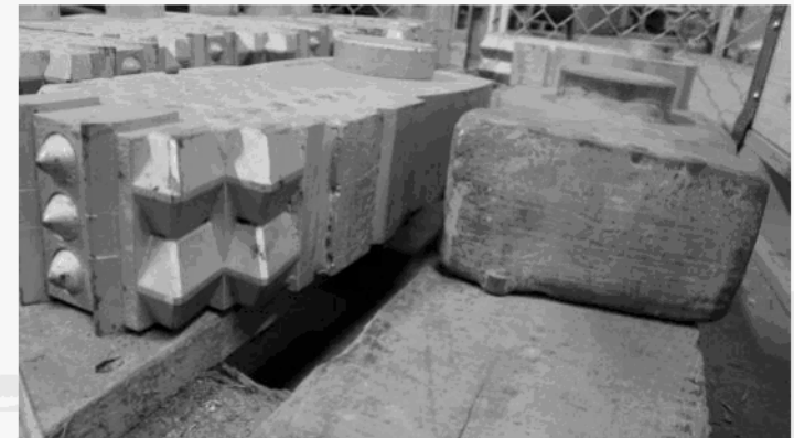
New and worn ripper tools