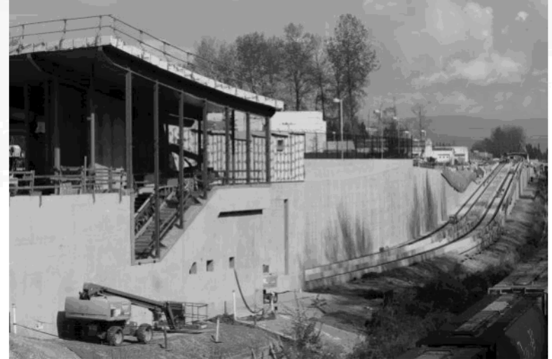
Inlet Centre Station looking east