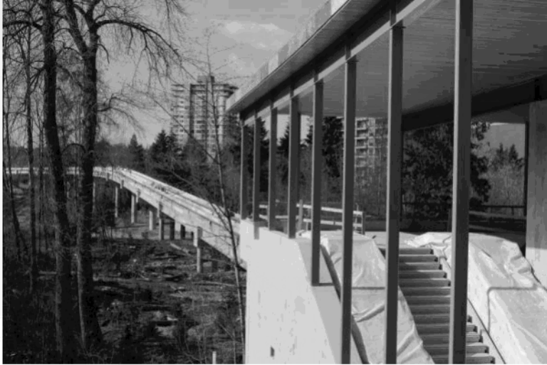
Inlet Centre Station looking west