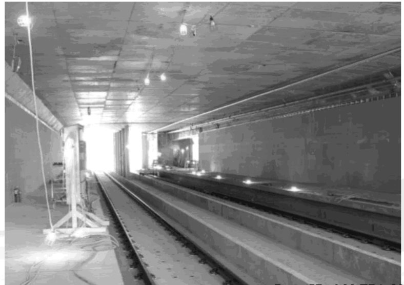
Inlet Centre Station passenger platform and guideway