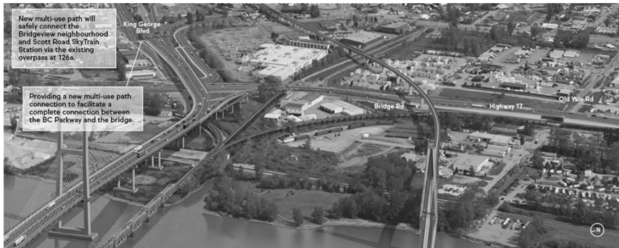
The Province's response to Surrey Stakeholder concerns (noted below) are illustrated above