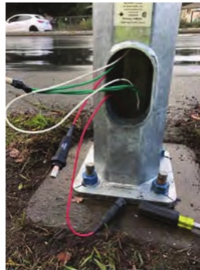
Fuse holder & boot