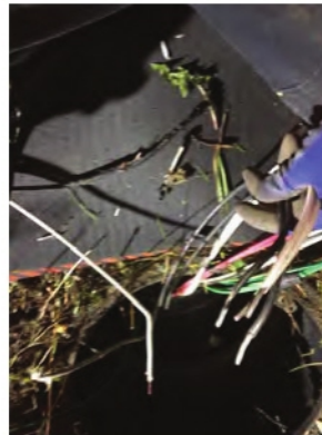
Remove broken street light feed conductors and resplice street lights