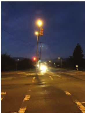
Reinstate Street light feed