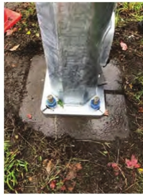
Install new nuts & washers