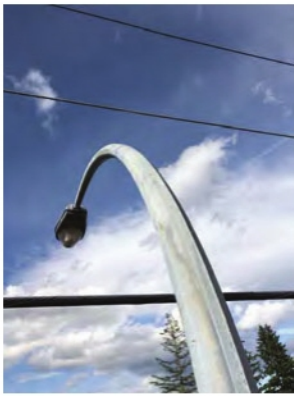
Investigate clearances at adjacent pole due to removal of 8 m pole with updated 8.5 m pole replacement