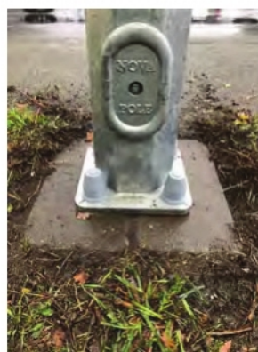
New nut covers