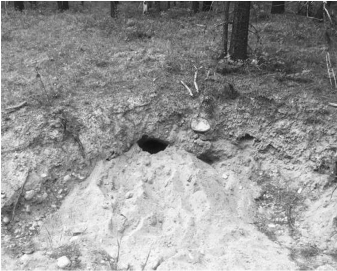
Figure 31. A freshly dug badger burrow.

Burrows are used by badgers for birthing sites, safe resting areas, food storage, and protection from the elements, particularly during winter when they may enter a state of torpor. Burrows may persist for up to a decade, depending on soil conditions, and are re-dug and re-used several times. Natal dens are burrows used for rearing young (kits). Females may move litters to new burrows throughout the rearing season (April–August). Table 32 summarizes what to look for when identifying an American Badger burrow.