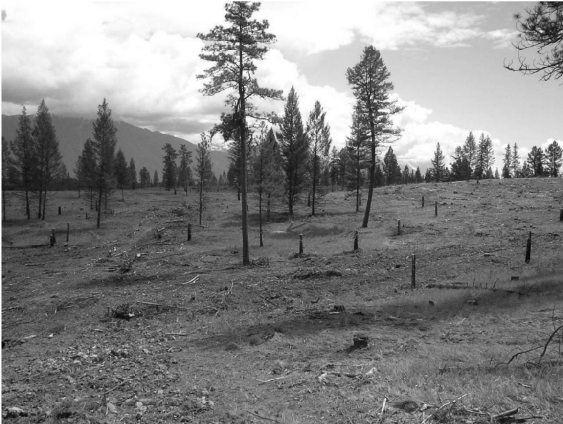
Figure 32. A no machine zone (green treed area in centre) established around an American Badger burrow (tan-coloured mound at red arrow). Note stub trees left around the perimeter of the zone.