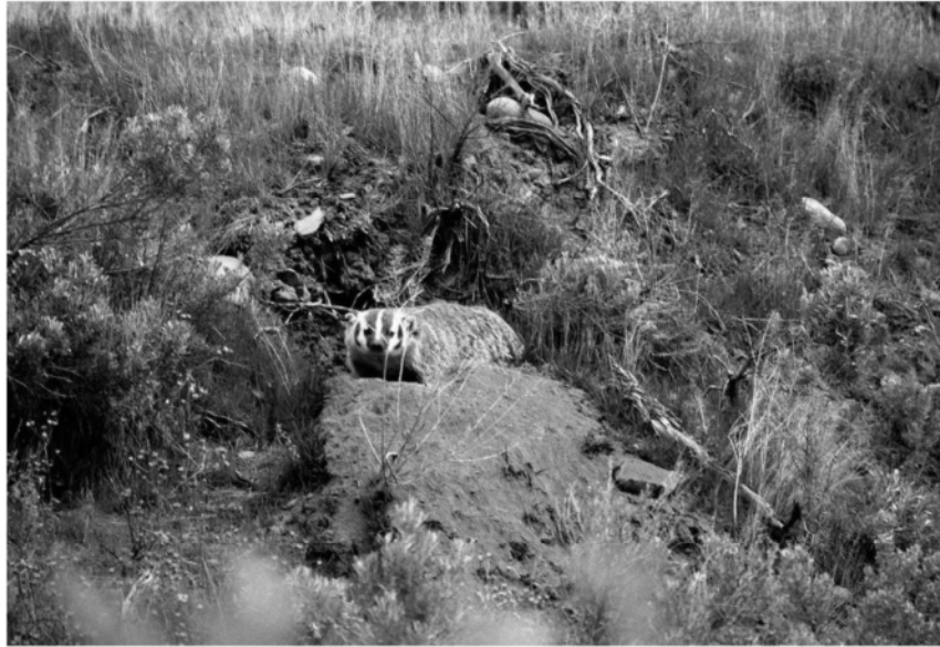
Figure 30. American Badger at its burrow.

An American Badger (Taxidea taxus) burrow means an excavated hole that descends below ground that either (1) is currently occupied for denning, shelter, or foraging; or (2) is habitually occupied and still capable of providing for denning, shelter, or foraging (Figure 30).